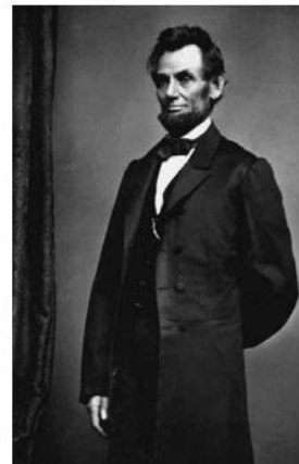
President Abraham Lincoln. Courtesy of the National Archives, NARA File # 111-B-3656.