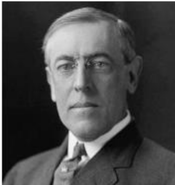
President Woodrow Wilson. Courtesy of the Library of Congress, LC-DIG-hec-16853.