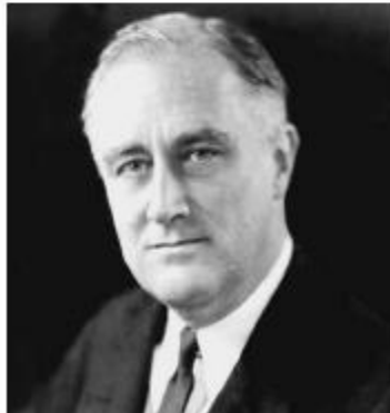
President Franklin D. Roosevelt.