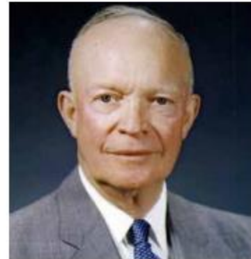
President Dwight D. Eisenhower.